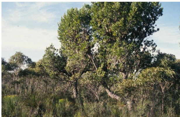
An example of the Banksia serrata woodland community at Wingaroo Nature Reserve, Flinders Island. Stephen Harris.

Banksia serrata woodland grows in various situations: peat soils on slopes, on sand plains or on granite-derived siliceous soils.