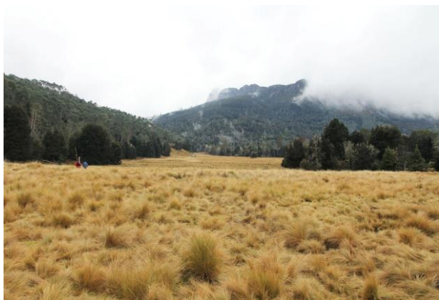
An example of the closed tussock facies of the Highland Poa grassland community at Lees Paddocks. Micah Visoiu.

Examples can be found at: Guildford, Middlesex Plains, Surrey Hills, Lemonthyme Plains and Vale of Belvoir (Northwest); Interlaken and Liawenee Moor (Central Plateau); Paradise Plains and Camden Plateau (Northeast Highlands).