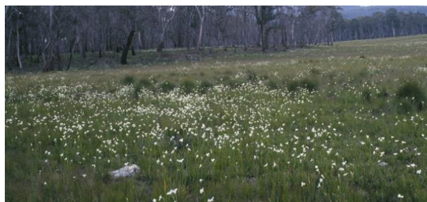
An example of the Subalpine Diplarrena latifolia rushland community at Navarre Plains, west of Derwent Bridge.

This community can be found at Navarre Plains near Mt King William, west of Lake St Clair and at the Vale of Belvoir to the north-west of Cradle Mountain.