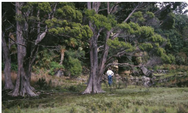
An example of the Subalpine Leptospermum nitidum woodland community at Lake Sydney, Southern Ranges. Keith Corbett.

The community is restricted to flats and gentle slopes on quartzite and siliceous flat-lying sediments in sub-alpine areas of western Tasmania, including sandstone shelves in the Southern Ranges. Shrubby forms can occur on exposed steeper slopes below alpine plateaux.