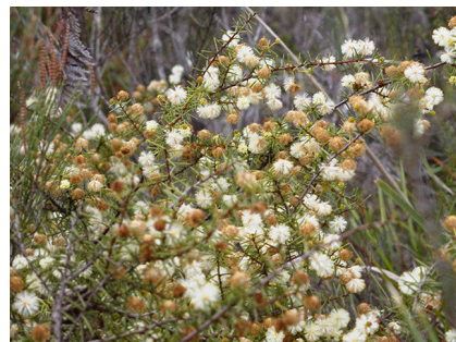
Acacia ulicifolia . N. Lawrence.

Key sites for this species include Lyme Regis, Cabbage Tree Hill, Beaconsfield, Bridport - Granite head area, Coles Bay, George Town, Scamander, Middleton Creek, Beechford, St Helens Point, North of Banksia grove, Rocky Cape National Park, Little Pipers River, north coast near Weymouth, Binalong Bay, Boat Harbour, Bluff Hill - Bluff Hill Point, Glengarry, Beaumaris and Waterhouse Road.