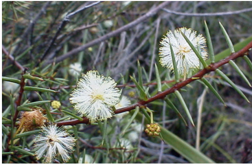
Acacia ulicifolia . N. Lawrence.