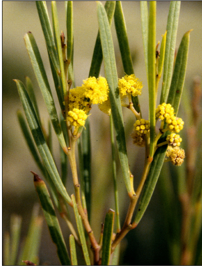
Acacia uncifolia . Image: N. Lawrence.