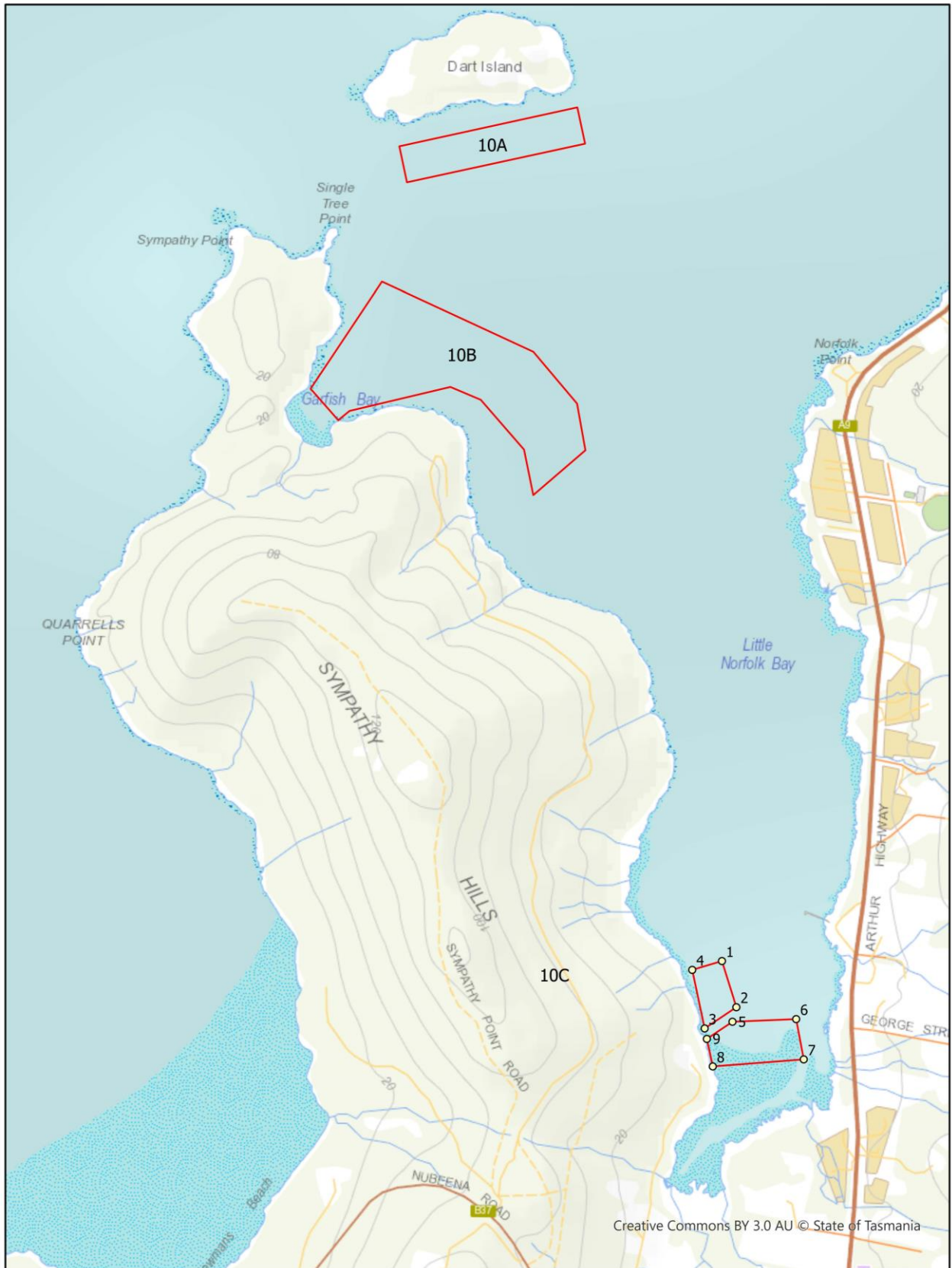
Map 2.8 - Tasman Peninsula & Norfolk Bay Marine Farming Zones 10A, 10B & 10C