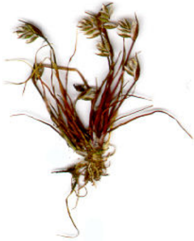
Aphelia gracilis . Threatened Species Unit.