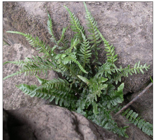
Plate 1. Blechnum spinulosum habit with dimorphic barren and fertile fronds