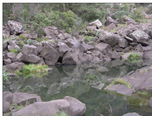
Plate 2. Blechnum spinulosum habitat at Cataract Gorge

Blechnum spinulosum is reserved within Sith Cala Nature Reserve and Trevallyn Nature Recreation Area.