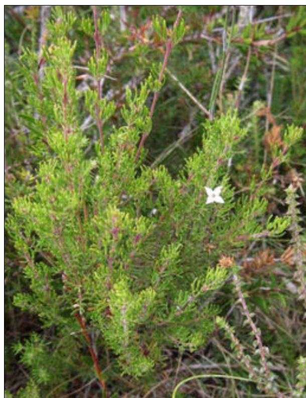
Plate 1. Boronia hippopala