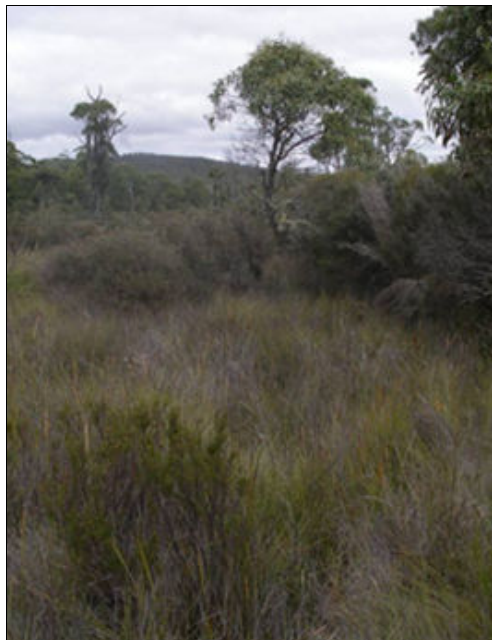
Plate 2. Wet heath/scrub habitat of Boronia hippopala at Flagstaff Marsh

Leptospermum lanigerum and Gabnia grandis , with occasional eucalypts such as Eucalyptus rodwayi (Plate 2), as well as in adjacent Eucalyptus pauciflora–dalrympleana woodland in which Micranthemum hexandrum , Leptospermum scoparium ,