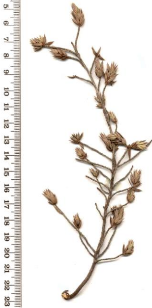
Brachyloma depressum . Tasmanian Herbarium specimen.