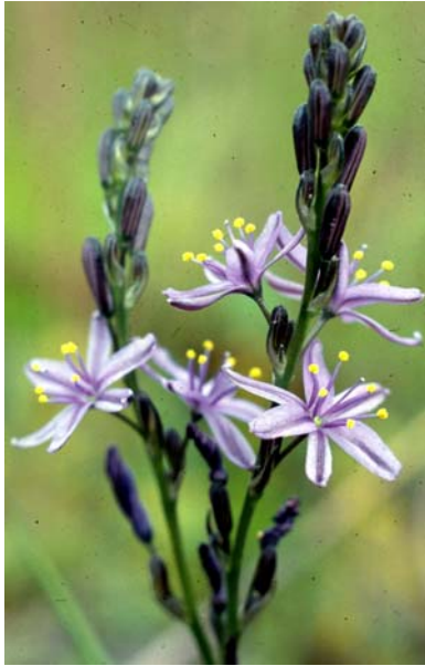
Caesia calliantha.