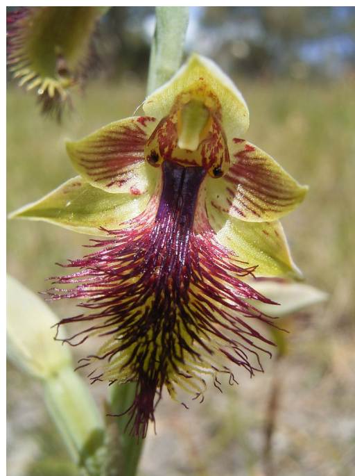
Plate 1. Calochilus campestris flower from Stony Point in Victoria