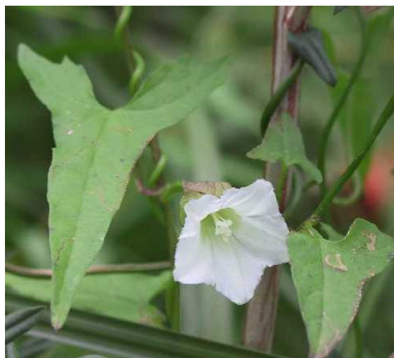
Plate 1. Calystegia marginata