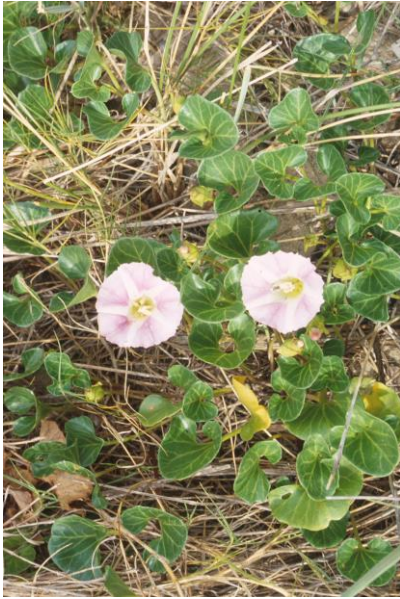
Calystegia soldanella .