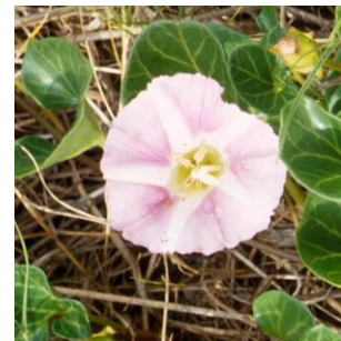
Calystegia soldanella .