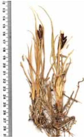
Carex hypandra . Tasmanian Herbarium specimen.