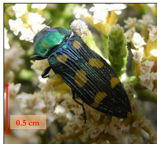
Plate 1. The Miena jewel beetle