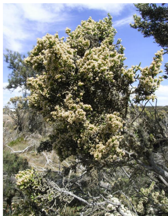
Plate 2b. Ozothamnus bookeri , food plant of the Miena jewel beetle at Tods Corner

Following mating, female Miena jewel beetles descend the branch to oviposit (lay eggs) into fissures in the bark. Upon hatching the larvae bore into the branch where they remain, to feed and grow and finally pupate, emerging as adults in summer. The length of the larval period is thought to be of a two-year duration.