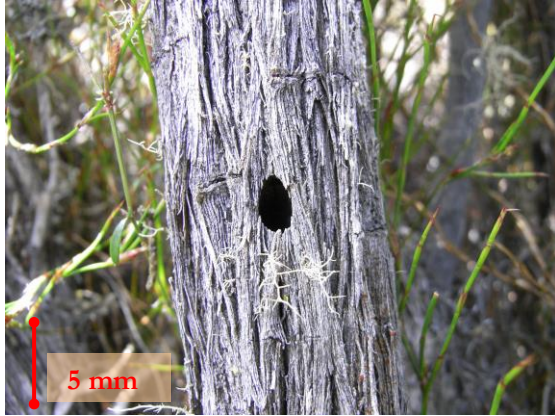
Plate 3. Emergence hole of the Miena jewel beetle on Ozothamnus bookeri

Emergence holes displaying a pointed-ovoid, D-shape, characteristic of Castiarina , are visible in the stems of Ozothamnus bookeri (Plate 3) and may be a useful feature to locate potential subpopulations of the beetle.