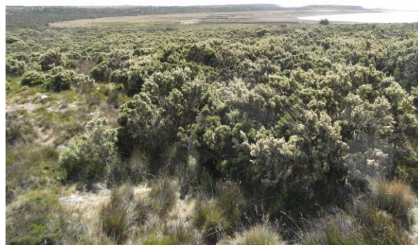
Plate 2a. Habitat of the Miena jewel beetle at Tods Corner

All sites occur on Jurassic dolerite. Current information suggests that the Miena jewel beetle has a specific association with the scaly everlastingbush ( Ozothamnus bookeri ) as both its larval host and adult food plant.