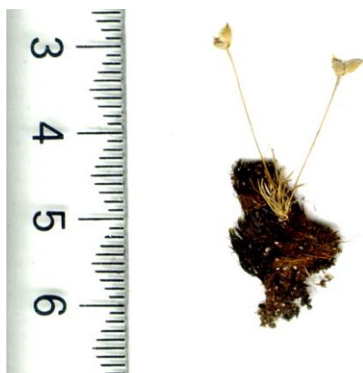
Centrolepis strigosa subsp. pulvinata . Tasmanian Herbarium specimen.