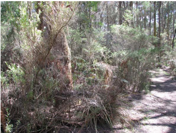
Plate 2. Habitat of Chiloglottis trapeziformis at the York Street bushland reserve in Wynyard.

Chiloglottis trapeziformis was first protected as rare on schedules of the Tasmanian Threatened Species Protection Act 1995 in 1995. It was uplisted to endangered in 2001, meeting criterion B because there are fewer than 250 mature individuals and its range is severely restricted (it occupies less than 1 hectare, and it is known to be extant in only 1 subpopulation).