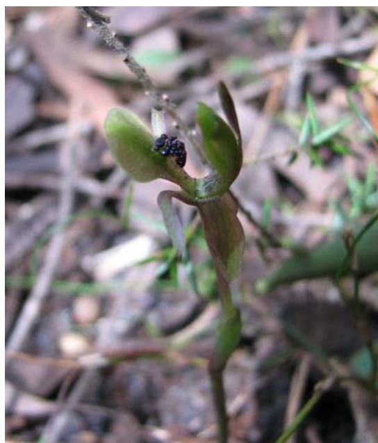
Plate 1. Chiloglottis trapeziformis flower from Wynyard