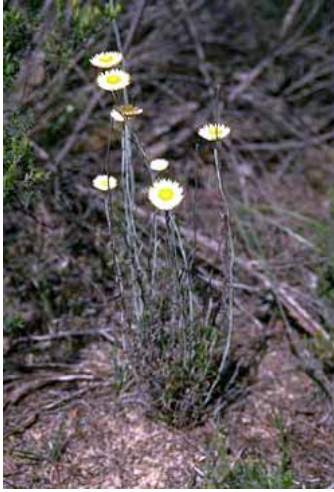
Chrysocephalum baxteri . A. Lyne (permission from ANBG website 2003)