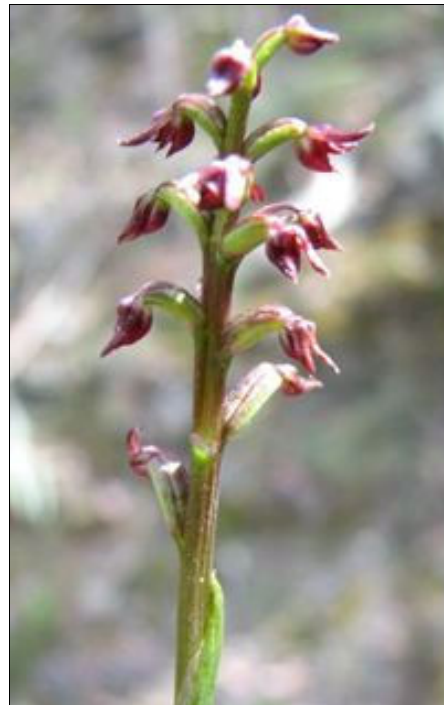
Plate 1. Corunastylis nuda inflorescence