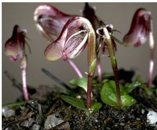
Plate 1. Corybas fordhamii from Appin Road in New South Wales