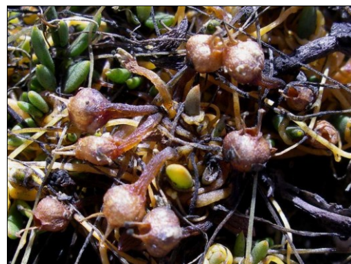
Plates 1–3. Cuscuta tasmanica : saltmarsh habitat (green plants = Wilsonia backhousei , claret plants = Sarcocornia quinqueflora ), habit & fruit