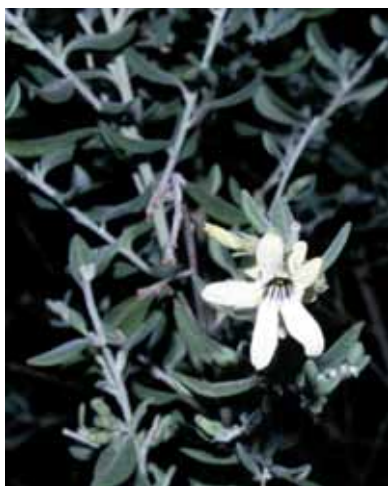
Cyphanthera tasmanica.