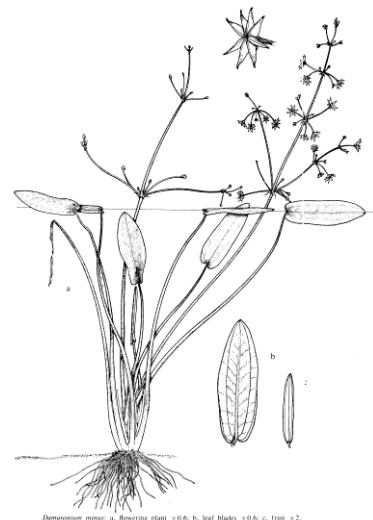
Damasonium minus . a, flowering plant \times 0.6 ; b, leaf blades \times 0.6 ; c, fruit \times 2 .