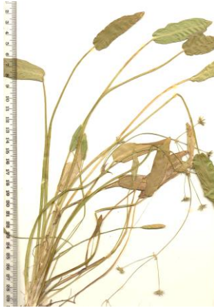
Damasonium minus . Tasmanian Herbarium specimen.