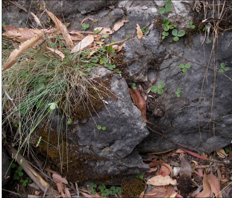
Figure 1. Desmodium gunnii growing on limestone at Dogs Head Hill