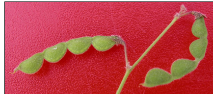
Figure 2. Desmodium fruit (not to scale). Left: D. gunnii ; Right: D. varians .