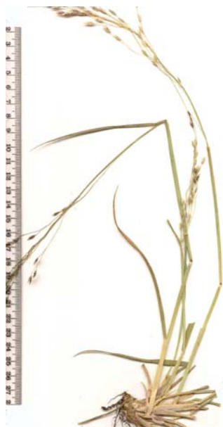
Dryopoa dives . Tasmanian Herbarium specimen.