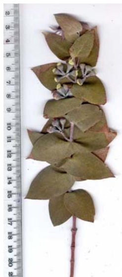
Eucalyptus risdonii . B. Craven.