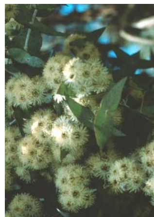
Eucalyptus risdonii flowers. R. Wiltshire.

This tree is distinctly bluish-green (glaucous) in colour and often grows to between 3-8 metres. The trunk is smooth, though circular leaf scars often remain until the first layer of bark is totally shed. After this stage, the trunk is ash-grey and streaked with cream. Leaves: The juvenile and adult leaves are similar in form and arranged oppositely along the stem. They are stalkless with the basal parts wrapped around the stem. The leaves are very glaucous, lance-shaped in outline and have a pointed tip. The pair of adult leaves measure between 6-10 cm long. Floral arrangement: The flowering parts (umbels) have between 5-15 flowers and are located in the axils (where the stem meets the leaf) of the leaves. The flower stalks are circular and between 7-12 mm long. The buds are stalked, club-shaped, glaucous and between 5-8 mm long. Fruit: The capsule is pear-shaped and between 8-10 mm in diameter. The openings on the upper surface of the capsule are level or enclosed. Distinguishing characteristics: This species is the only known example in the subgenus Monocalyptus that retains the juvenile foliage form on reproductive branches (description from Curtis 1975). Confusing species: Eucalyptus risdonii intergrades with Eucalyptus tenuiramis but can be distinguished from this species by the higher proportion of individuals with fruit at nodes with juvenile foliage.