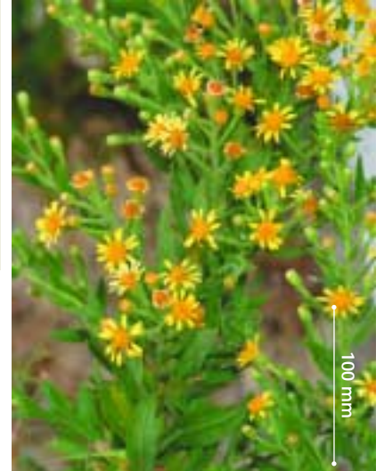
During summer and autumn, each bush can have hundreds of yellow flowers.

False yellowhead is native to southern Europe (including France, Spain, Greece,