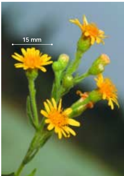
The daisy-like flowers occur in groups of 4–12.

The above contacts can offer advice on weed control in your state or territory. If using herbicides always read the label and follow instructions carefully. Particular care should be taken when using herbicides near waterways because rainfall running off the land into waterways can carry herbicides with it. Permits from state or territory Environment Protection Authorities may be required if herbicides are to be sprayed on riverbanks.