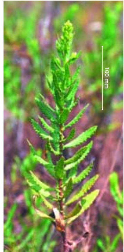
The leaves are elliptical, partially stem claspings and serrated on the edges.

Do not buy seeds via the internet or from mail order catalogues unless you check with quarantine first and can be sure that they are free of weeds like false yellowhead. Call 1800 803 006 or see the Australian Quarantine and Inspection Service (AQIS) import conditions database < www.aqis.gov.au/icon >. Also, take care when travelling overseas that you do not choose souvenirs made from or containing seeds, or bring back seeds attached to hiking or camping equipment. Report any breaches of quarantine you see to AQIS.