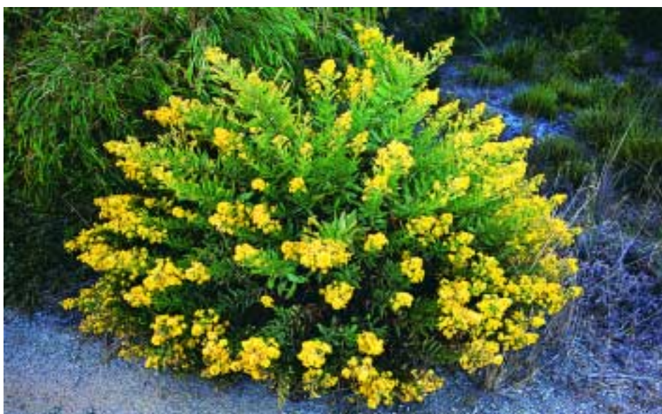
False yellowhead is most common in disturbed areas such as roadsides and walking trails.

False yellowhead is an erect, perennial, soft-wooded shrub, 1–1.5 m tall and 1 m wide. Its leaves are greyish-green and elliptical (ie oval-shaped with the ends pinched together), 25–100 mm long