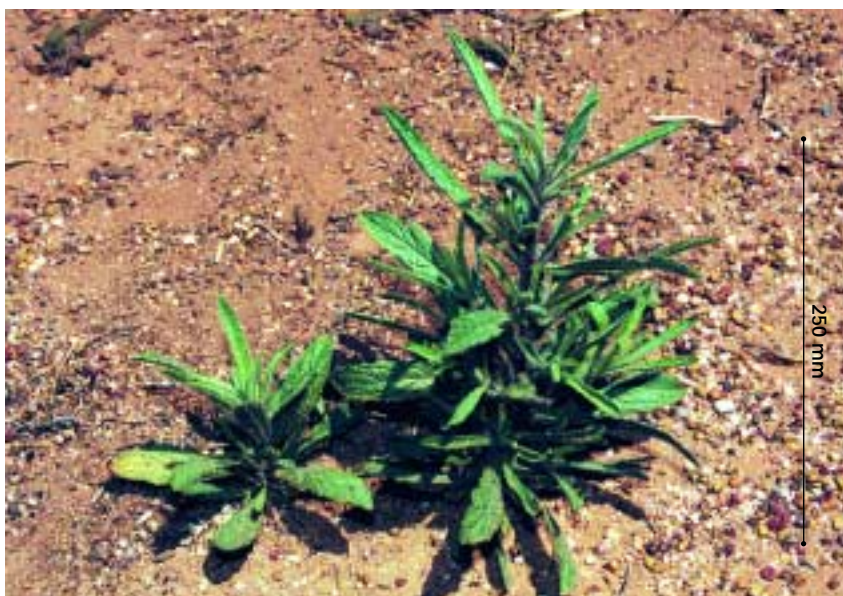
Stinkwort Dittrichia graveolens is a closely related agricultural weed of southern Australia.

False yellowhead has the potential to be a serious environmental weed, particularly in southwestern Western Australia and areas of similar climate in southern and eastern Australia, if it is allowed to spread. Infestations of false yellowhead would detract from the aesthetic and natural values of bushland and could reduce its tourism appeal. The costs of management (eg clearing from railway lines or walking trails) would also be significant.