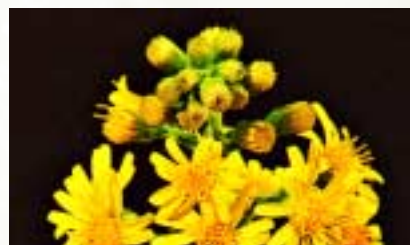
False yellowhead has spread hundreds of kilometres in 50 years.

Once the initial infestation is controlled, follow-up monitoring and control will be required to ensure that reinfestation does not occur.