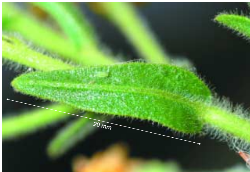
Hairs that cover the young stems and leaves exude a sticky foul-smelling oil.