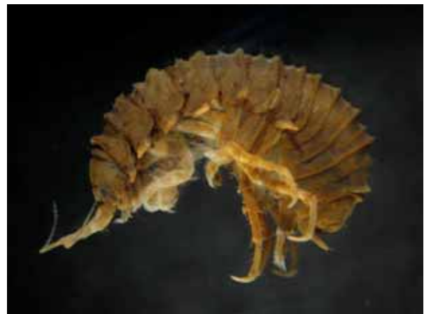
Onchotelson spatulatus .