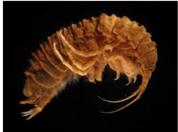
Onchotelson brevicaudatus .

Phreatoicid isopods are small (13mm-22mm), plated, slater-like crustaceans. They have rounded heads, very small eyes and seven pairs of legs. Three of the five species listed are illustrated below: