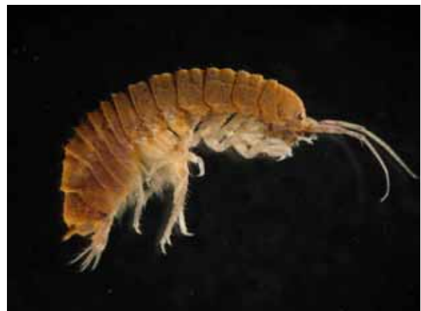
Mesocanthotelson setosus (female).