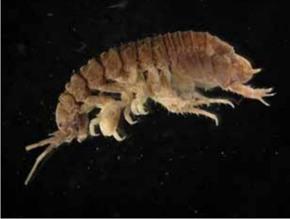
M. setosus (male)

Onchotelson species have a very rugose body. O. brevicaudatus reaches 15 mm and O. spatulatus 13 mm. O. spatulatus differs from O. brevicaudatus and from other Tasmanian phreatoicids by having strong epaulette-like extensions on the side of the body (see image).