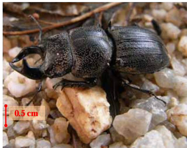
Plate 1. Vanderschoors Stag Beetle (male)