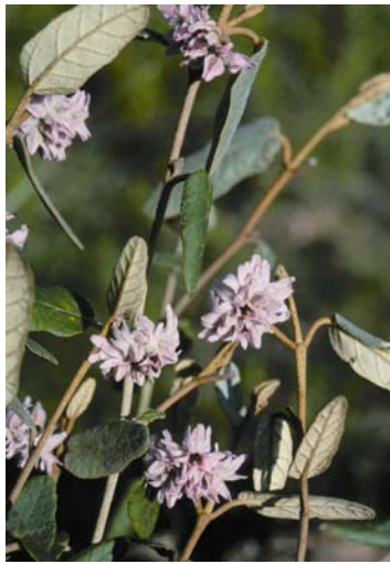
Lasiopetalum discolor.