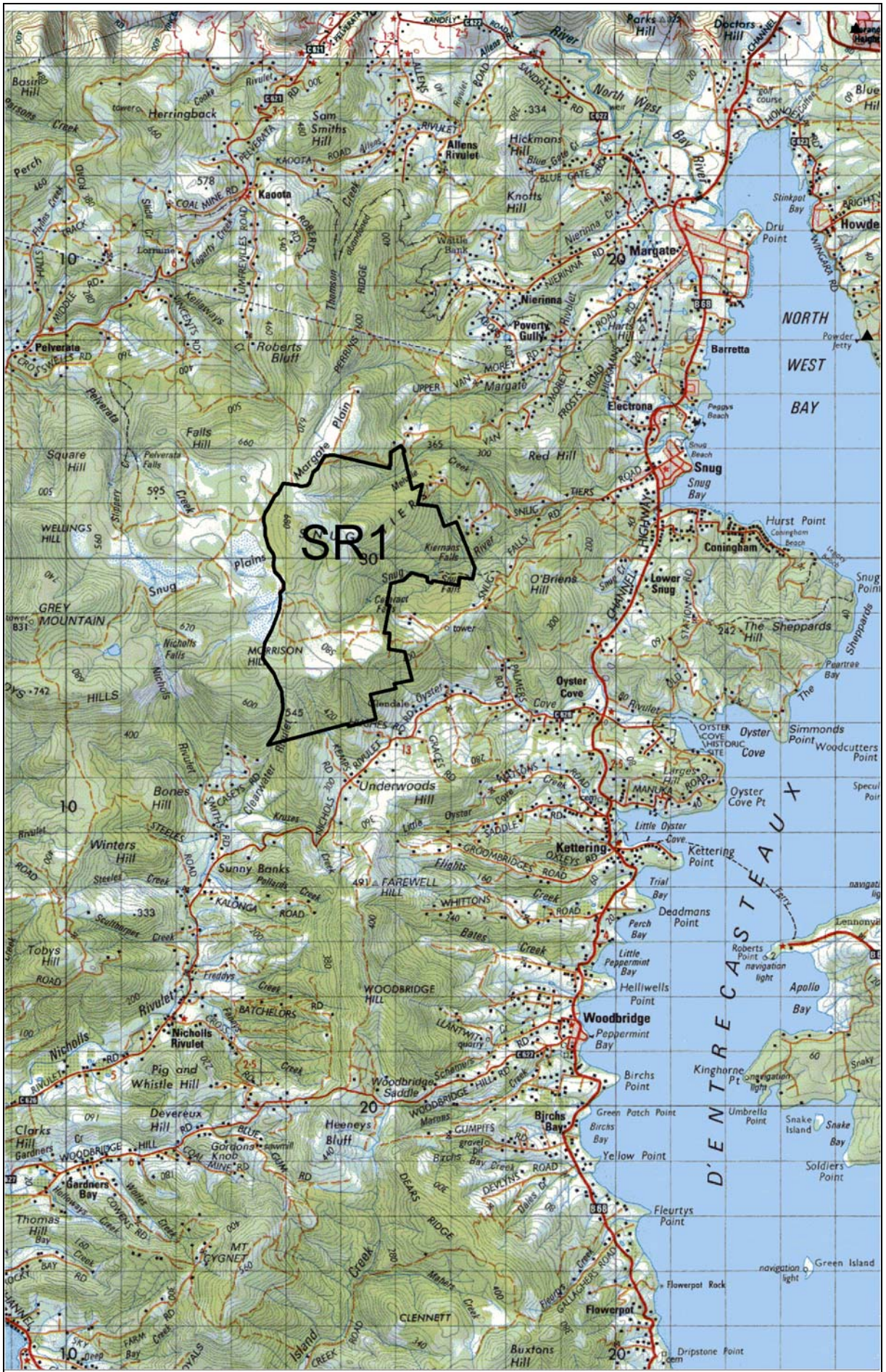
Conservation of Tasmanian Plant Species & Communities Threatened by Phytophthora cinnamomi