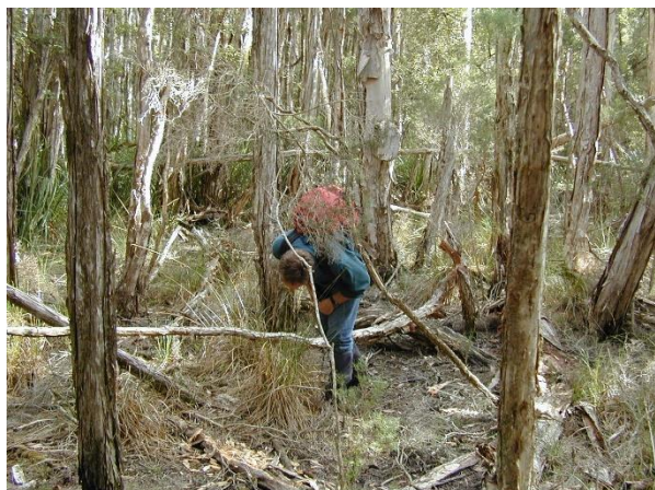
Plate 5. Swamp forest habitat of the Marrawah skipper