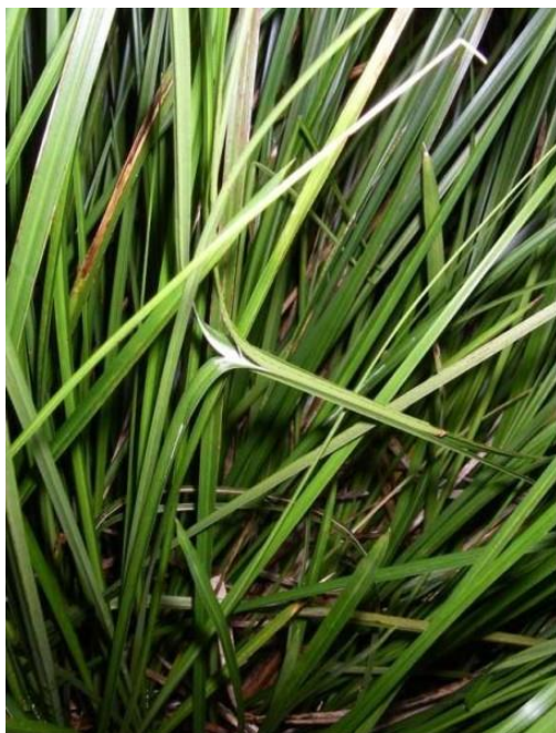
Plate 3. Distinctive appearance of larval shelter of the Marrawah skipper in leaves of Carex appressa

Some expertise and training is required to detect and identify the larval/pupal shelters and evidence of larval feeding.