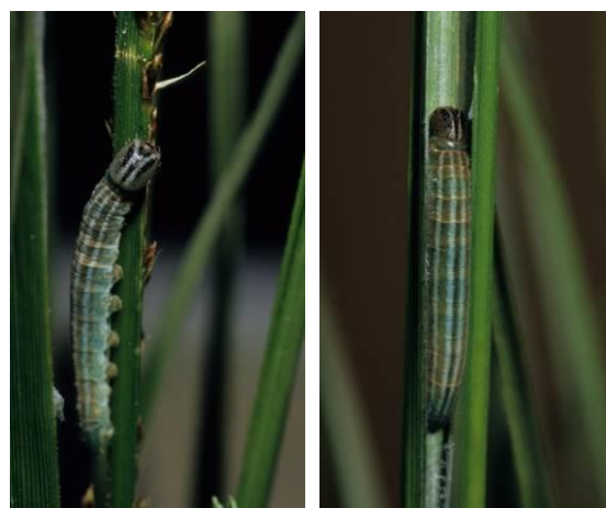
Plate 2. Larvae of the Marawah skipper feeding on Carex appressa

There is one other subspecies, the alpine sedge-skipper ( Oreisplanus munionga subsp. munionga ), which occurs in the mountains of southeastern mainland Australia between 1060 m and 1600 m (Braby 2000).