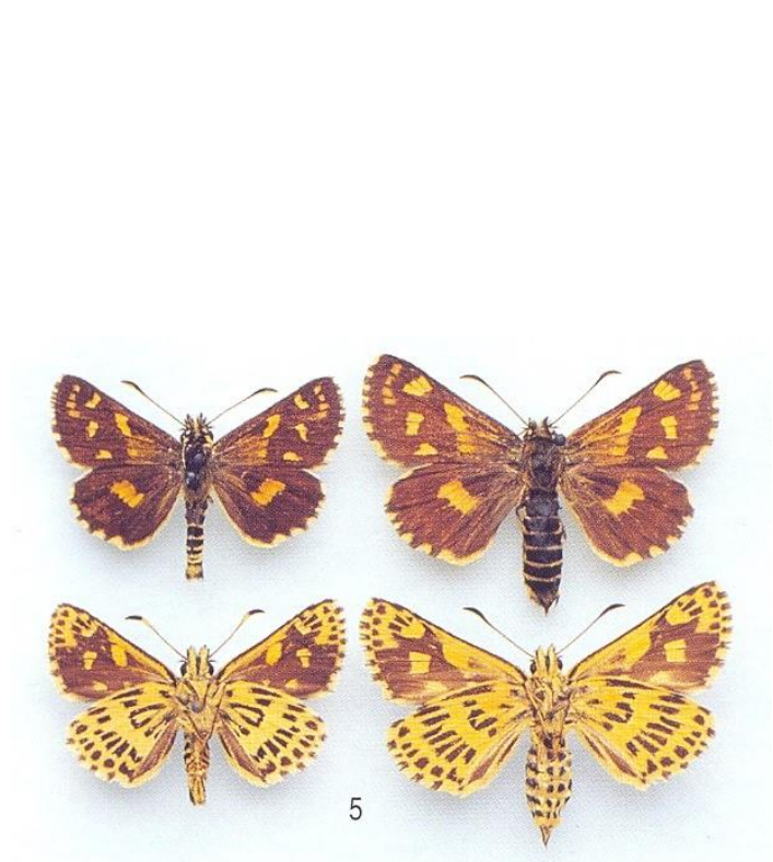
Plate 1. Marrawah skipper