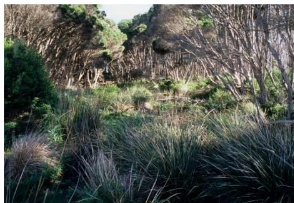
Plate 4. Dense Carex appressa habitat of the Marrawah skipper

The Marrawah skipper is a powerful flyer and may be able to travel tens of kilometres in a flying season (P. Bell pers. comm.) but no specific data is available on their movements between sites.