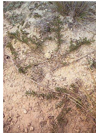
Myoporum parvifolium habitat.

A small shrub with tall branches (up to 60 cm long) that are erect or trailing loosely along the ground, but not rooting. The branches are reddish and have scattered glands bearing small blunt projections. Leaves: The leaves are stalkless or nearly so, narrow to spoon-shaped, blunt and between 6-30 mm long and 2.5 mm broad. They are thick and semi-succulent with prominent glands bearing small blunt projections. Flowers: The small flowers are star-shaped and pink or white with purple spots. They are situated in the axils (where stem meets leaf) of the plant and can be either solitary or in clusters of 2-3. The flowers are also borne on slender, gland-covered stalks that are shorter or about the same length as the leaves. The calyx (outermost whorl of floral parts) is approximately 3 mm long and deeply divided with lance shaped lobes that have glands. There are 4 stamens (male parts) and the anthers (pollen) holding structures protrude slightly. Flowering occurs between September to October. Fruit: The fruit is an edible, round purplish drupe that is between 4-6 mm in diameter (description from Curtis 1967, Grey et al. 2001). Herbarium specimens have been collected from November to February.