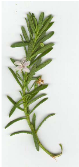
Myoporum parvifolium . Threatened Species Unit