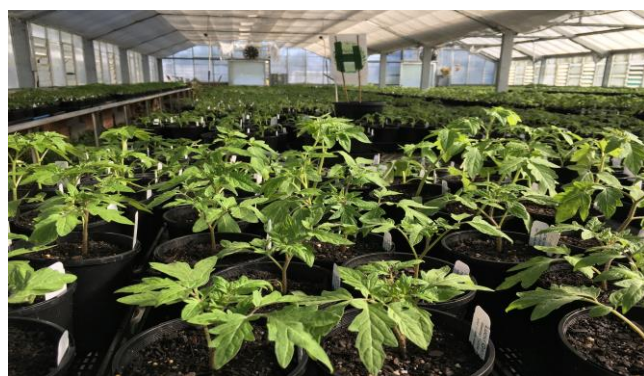
Figure 4 – Tomato plants ready for the Annual Tomato Plant Sale.