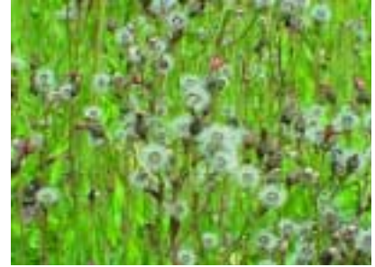
Ripe seed heads ready to be dispersed by the wind.