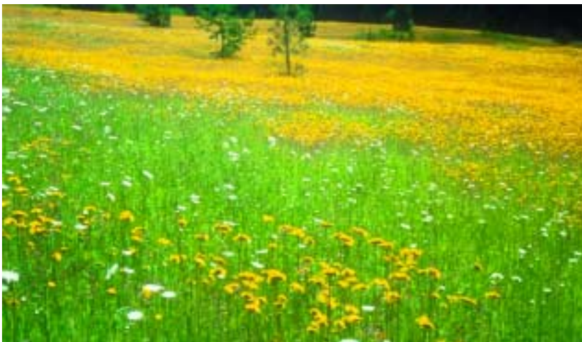
Meadow hawkweed Hieracium caespitosum invading pasture in eastern United States.

During the flowering season (November–March), orange hawkweed has distinctive orange flowers with square-edged petals. If not flowering, the presence of runners and short black hairs on stems and leaves will help identify this species.