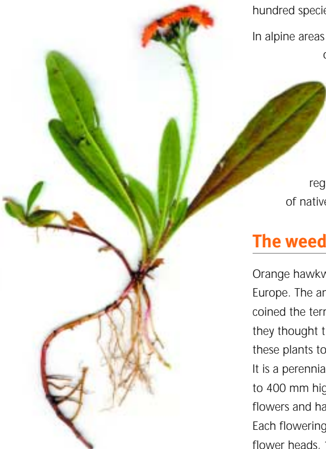
Orange hawkweed can reproduce by both seeds and stolons. Plants normally produce between four and eight stolons.

The orange flowers, with square-edged petals, make flowering plants easy to identify. Distinguishing features of non-flowering plants include the presence of stolons or 'runners' (stems that lie horizontally on the ground) and numerous short black hairs on the stems and leaves. Leaves usually grow at a slight angle to the ground but under grazing pressure and harsh conditions they lie flat. Orange hawkweed is also known as 'devil's paintbrush', 'red devil' and 'grim-the-collier'.