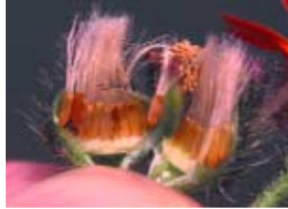
Unripe fruit inside the flower, showing the tuft of bristles on the end of the seed.