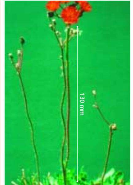
The main stem grows longer and produces a flower head as day length increases during spring.

clearing and road maintenance machinery, and be carried on ski equipment between resorts within Australia and overseas. Although its entry to Australia is prohibited, orange hawkweed is sometimes found in nurseries (often as seed) and as a component in 'wildflower' seed mixes. It has also been promoted as a herbal plant.