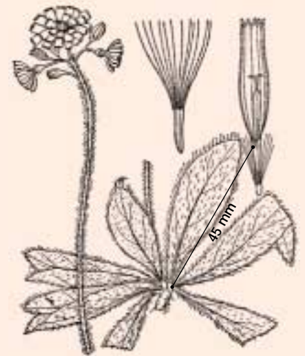
The general growth habit of orange hawkweed.

Areas that contain vigorously growing grasses appear to be less susceptible to the spread of hawkweed. At the Fern Tree infestation, grass growth is subdued in winter, thus reducing the amount of competition.