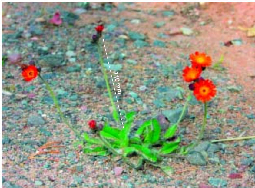
Orange hawkweed tends to grow in disturbed areas such as roadsides.

Seeding is important for more widespread dispersal. Minute barbs along ribs on the seeds enable them to stick to hair, fur, feathers, clothing and vehicles, and be carried long distances. Seeds can be dispersed by wind and water, and in dumped garden waste and contaminated soil. They may also be spread by snow