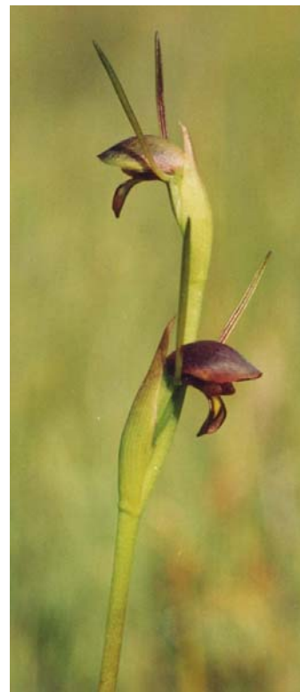
Plate 1. Orthoceras strictum flowers