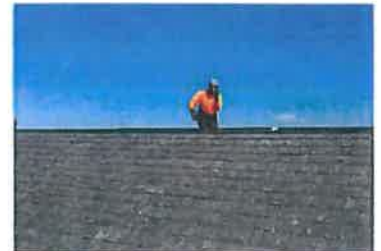
Re-slating ‘Clarendon’ with 10,000 Welsh slates.

Local job creation, up skilling of trades, engagement of apprentices, community pride – a ‘good news’ story. Project delivered on time, on budget and to international heritage standards.