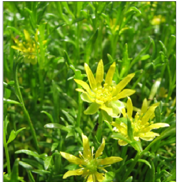
Plate 1. Ranunculus prasinus