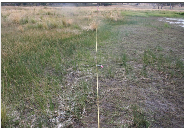
Plate 2. Ranunculus prasinus habitat at Near Lagoon

Ranunculus prasinus occurs on the margins of brackish wetlands where herbfields merge into grasslands dominated by silver tussockgrass (Plate 2). When the wetlands dry, the species may expand onto the wetland floor. All sites are flat or gently sloping and occur at altitudes of 190 to 260 metres above sea level. Soils are generally heavy clays and tend to be alkaline, the pH varying from 7.0 to 8.5 (Gilfedder et al. 1997).