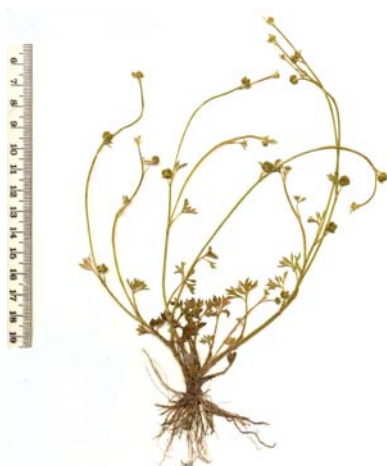
Ranunculus pumilio var. pumilio . Tasmanian Herbarium specimen.