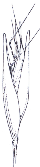
Rytidosperma remotum spikelet.