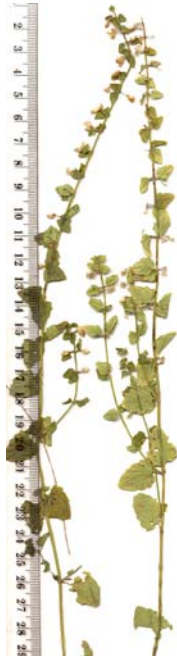
Scutellaria humilis . Tasmanian Herbarium specimens.