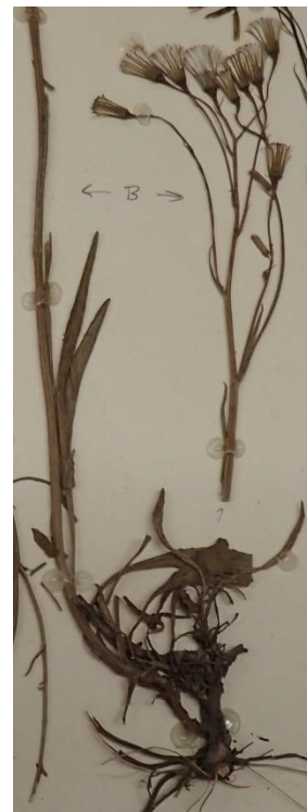
Plate 1. Senecio tasmanicus (specimen from the Tasmanian Herbarium)