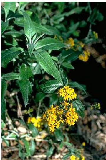
Senecio macrocarpus . Permission from ANBG website.