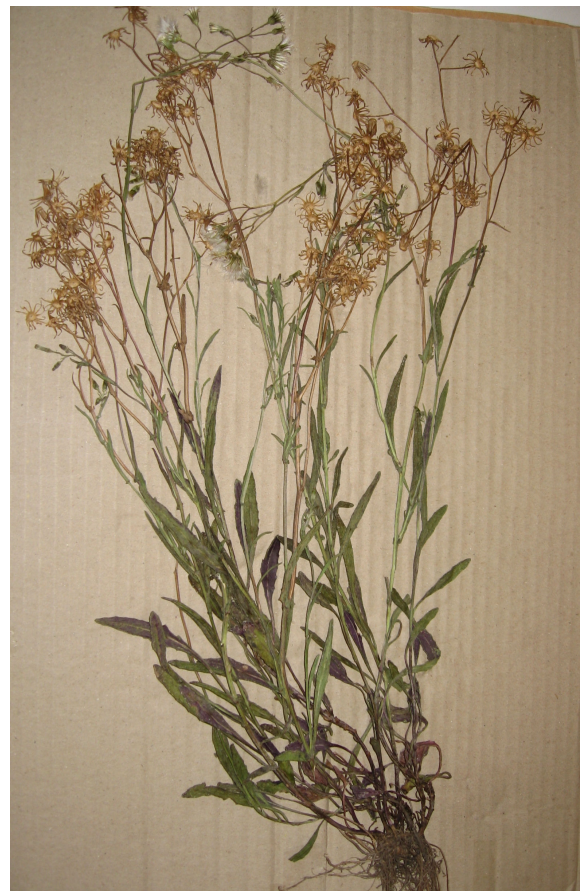
Plate 1. Specimen of Senecio psilocarpus from Dukes Marshes