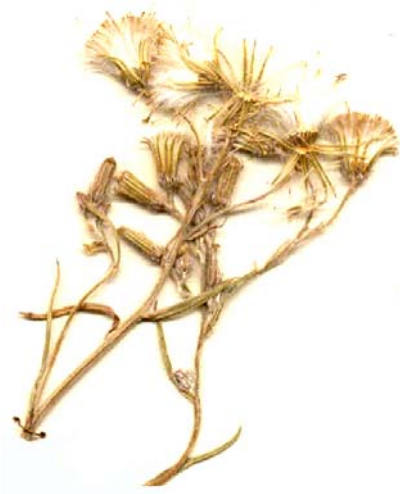
Senecio squarrosus . Tasmanian Herbarium specimen.