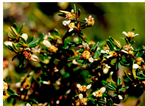
Spyridium vexilliferum var. vexilliferum.

Key sites for this species include Couta Rocks, the west side of Chinese Creek, Schouten Island, Coles Bay, the Molesworth area, Queenstown, the Cataract Gorge, Coles Bay towards Fisheries, Coles Bay near Hazards, Risdon, Launceston, Flinders Island, near Little Swanport, Cape Portland, Prime Seal Island, Apsley Marshes, Patrick River near Nunamara, Temma Road near Arthur River, Marrawah, near Moulting Lagoon, Bluff Hill, Bluff Hill Point, Bluff above Pipers River near Karoola, Epping Forest and Kafoozalum Creek.