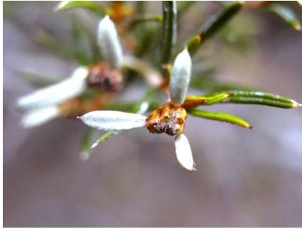
Spyridium vexilliferum var. vexilliferum . E. Lazarus.