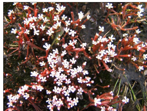
Stylidium beaugleholei : habitat at Seal Rocks (King Island) and habit at Nettley Bay (Arthur-Pieman)