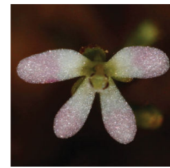
Figure 1. Fan-shaped arrangement of corolla lobes: x = position of labellum, a = anterior lobe, p = posterior lobe.