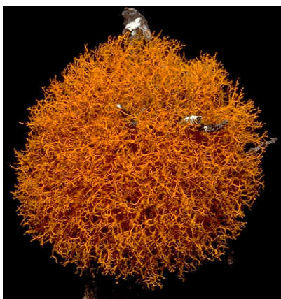
Teloschistes flavicans.